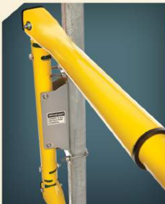
▲ Perpendicular mount