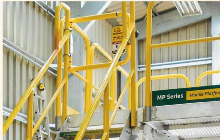
▲ Universal mounting systems mounts with no additional parts to order.