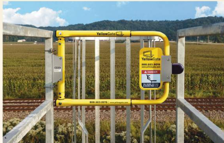
▲ 24" [610 mm] wide platform.