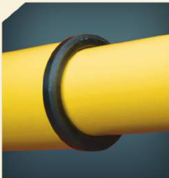
▲ Field-adjustable length from 16" [406 mm] to 36" [914 mm].