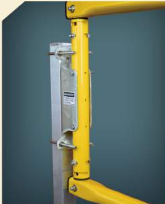
▲ Parallel mount